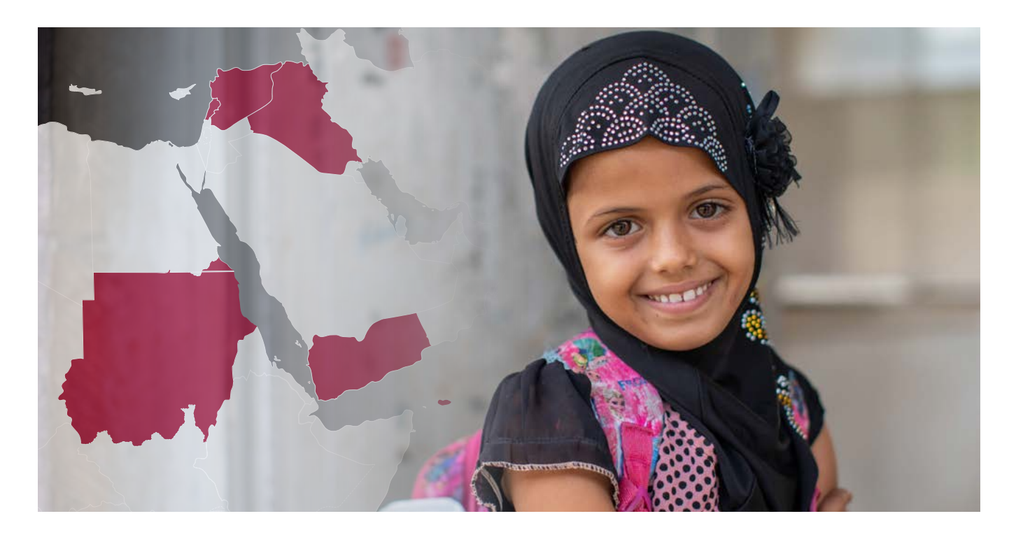
Regional overview and country hotspots