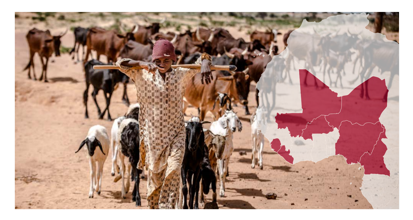
Regional overview and country hotspots