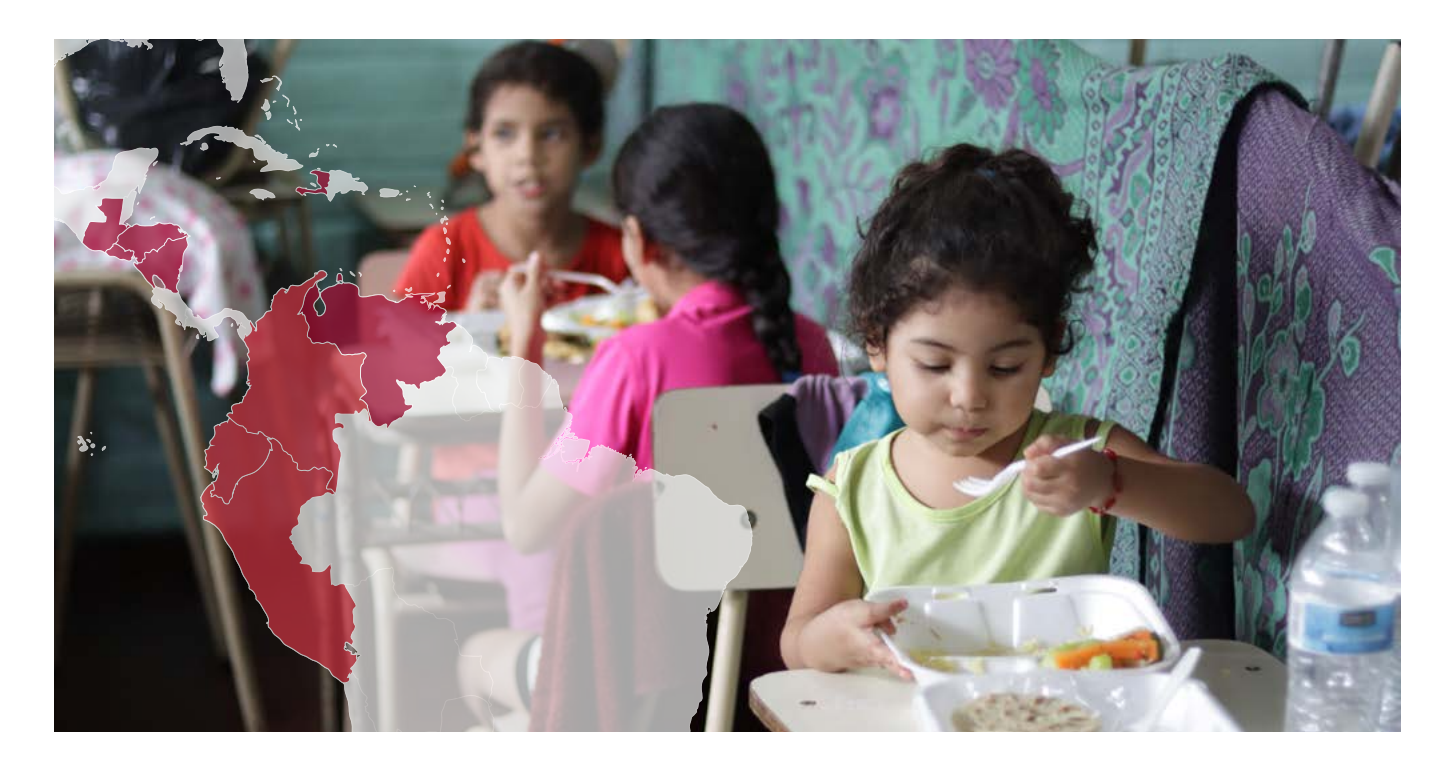
Regional overview and country hotspots