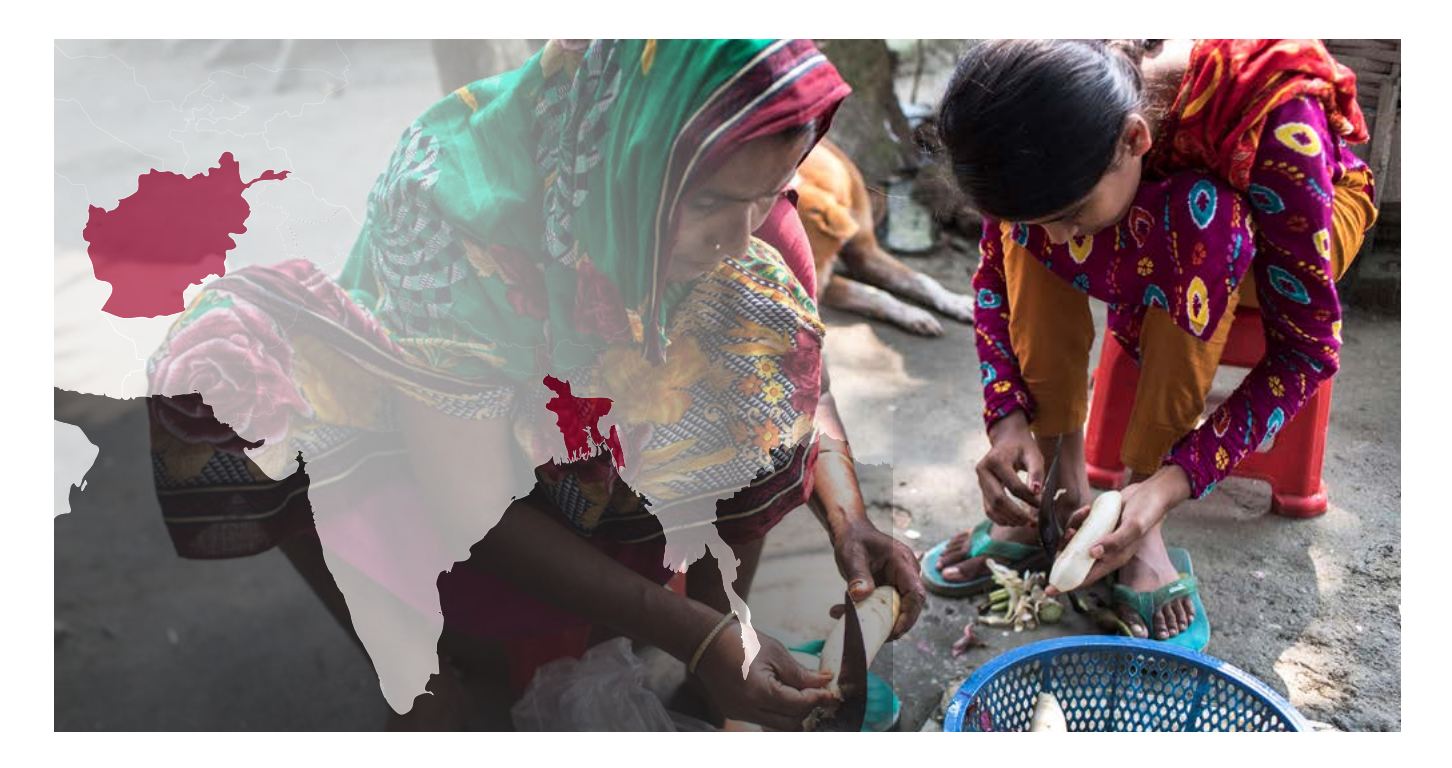
Regional overview and country hotspots