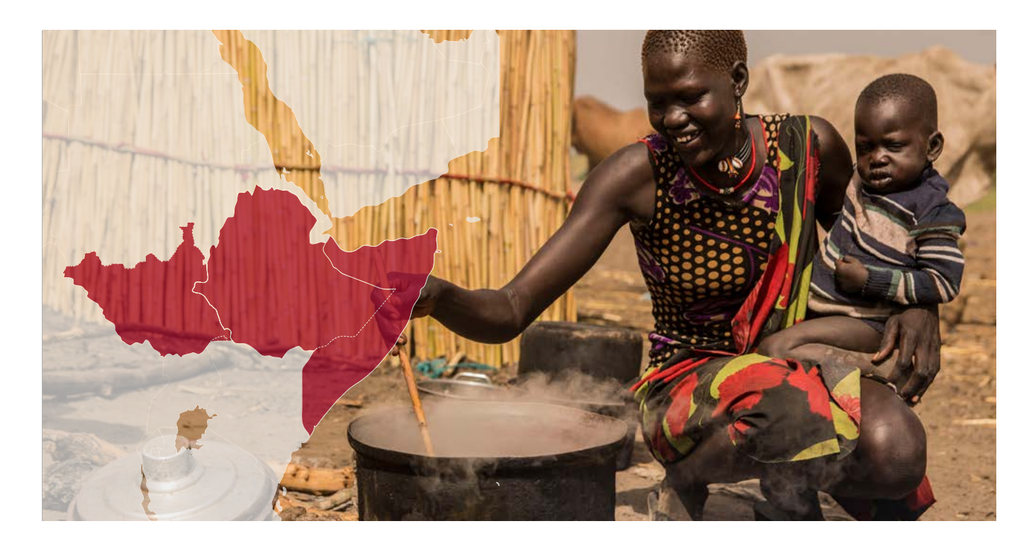
Regional overview and country hotspots