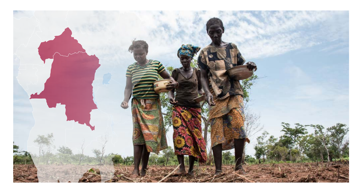
Regional overview and country hotspots