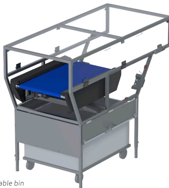
Optional: Lockable bin including conveyor belt